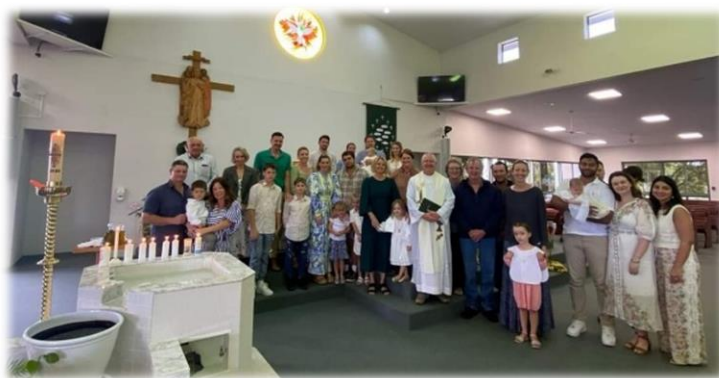
Nine Baptisms at Sacred Heart, Lammermoor

What a wonderful time of gatherings and sacramental preparation this month has been!