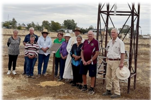
A small crowd of current and former parishioners gathered for the official unveiling